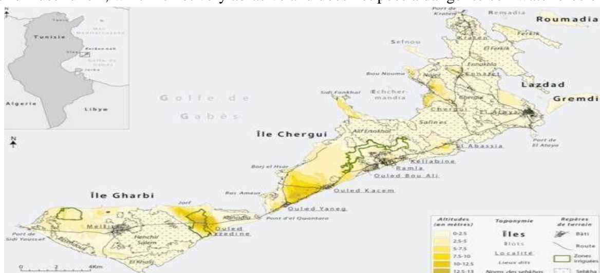
Figure 1. Location of the Kerkennah Archipelago (In Etienne et al., 2015).

The Kerkennah archipelago (Figure 1) is located in the Gulf of Gabes, 20 km from Sfax and 260 km southeast of Tunis (Coordinates: 34° 39' 29" N and 11°04' 07" E). It extends over a strip of 3.5 km wide and 45 km long) with an almost flat relief of no more than 13 m in altitude (Dahech, 2007). However, this apparently featureless territory is marked by a succession of imperceptible hills that form low lagoons. Flat areas of land with slight elevations are the source of diffuse runoff, which is not very abrasive and does not pose a danger to soil water erosion.