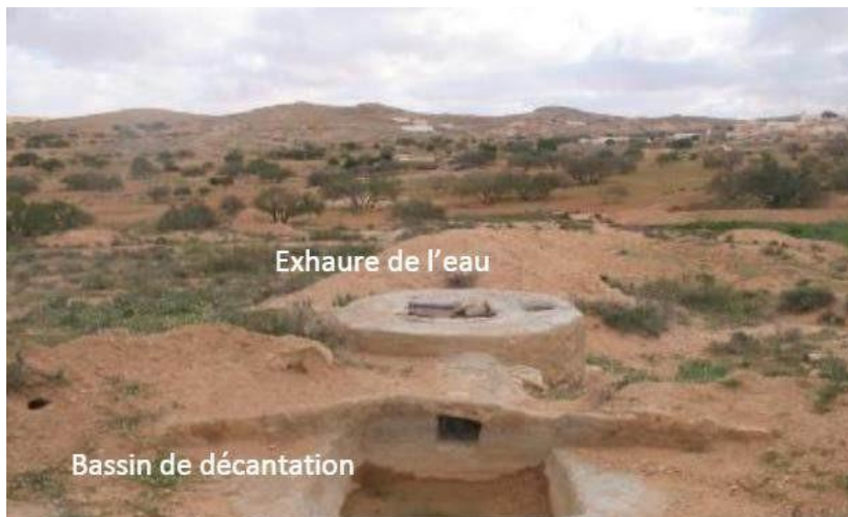
Figure 5. The agricultural tanks are managed together by the farmers' collective. This management still obeys local customs which are based on Islamic legislation that is still in force (El Amami, 1983).

Domestic cisterns, commonly known as Majel or Fesguia according to the geometric shape of the basin (Moussa, 2013), call on local know-how to compensate for the lack of water, especially in summer. These are underground reservoirs built of reinforced concrete under the dwellings which consist of collecting rainwater that has fallen on the terraces and connected to the reservoirs by hydraulic pipe ( Figure 6 ). Their volume of water depends on rainfall and