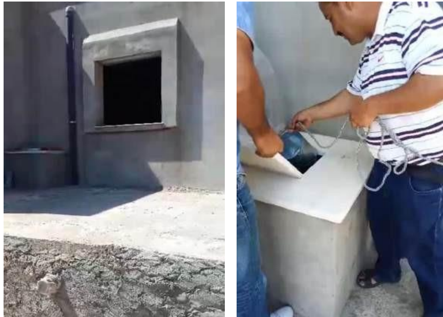
Figure 6. Domestic masonry cistern made by a private individual whose water is drawn manually. Kerkennah, July 2023.

the surface area of the terraces. It varies from 20 to 200 m 3 with an average of 80 m 3 (Chahbani, 2003). The terraces are limed before each rainy season to make the water "drinkable". The drawing and distribution of water is generally done manually. But improvements were introduced to draw water directly from an electric motor pump.