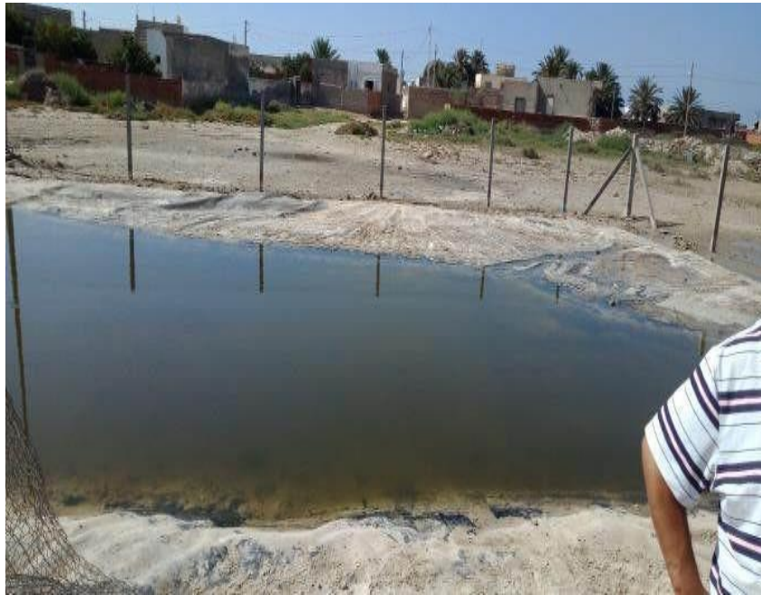
Figure 3. The experimental plot of Lataya, with geo-membrane and geotextile felt. Kerkennah, July 2023.

On the other hand, the pond brings a richness from the floristic and faunal point of view and also contributes to the diversity of the landscapes.